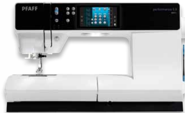
Exceptional space for large amounts of fabric.

Just one touch and the machine ties off, the presser foot is lowered or lifted automatically, the upper and bobbin threads are cut, the feed dogs are lowered ... when you want it to happen.