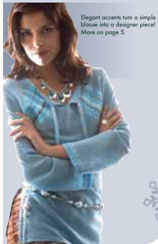
Elegant accents turn a simple blouse into a designer piece! More on page 5.

Dear hobby sewer, Once again, YOURSTYLE, your magazine from Pfaff, is full of creative ideas. Winter is the time when people most enjoy crafts, sewing and being creative. Let us inspire you - with fantastic projects to sew yourself, such as winter star decorations, beautiful quilts, enchanting embroideries, and much more. You'll also find the latest news about sewing machines and accessories - to give you new ideas and help you get better results. We wish you lots of fun and a very creative time! Your editors!