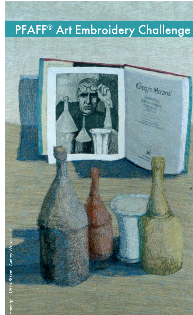
'Homege' - 120 x 80 cm - Audrey Walker - UK